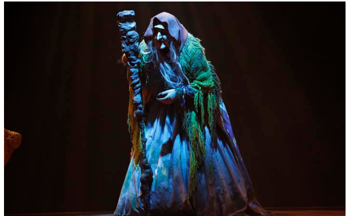
Figure 6: Victorian Opera - Into the Woods (Witch)