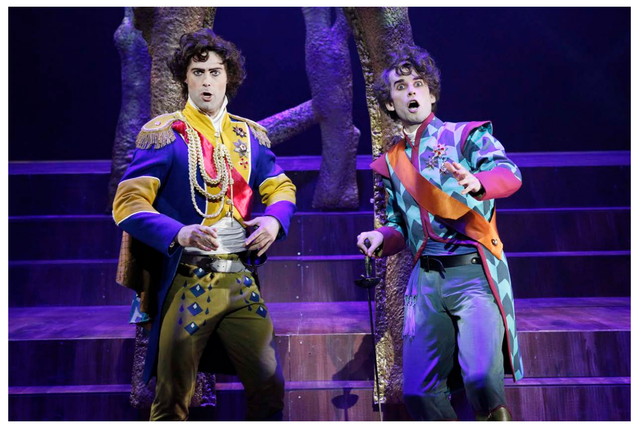
Figure 8: Victorian Opera - Into the Woods (Cinderella's Prince and Rapunzel's Prince)