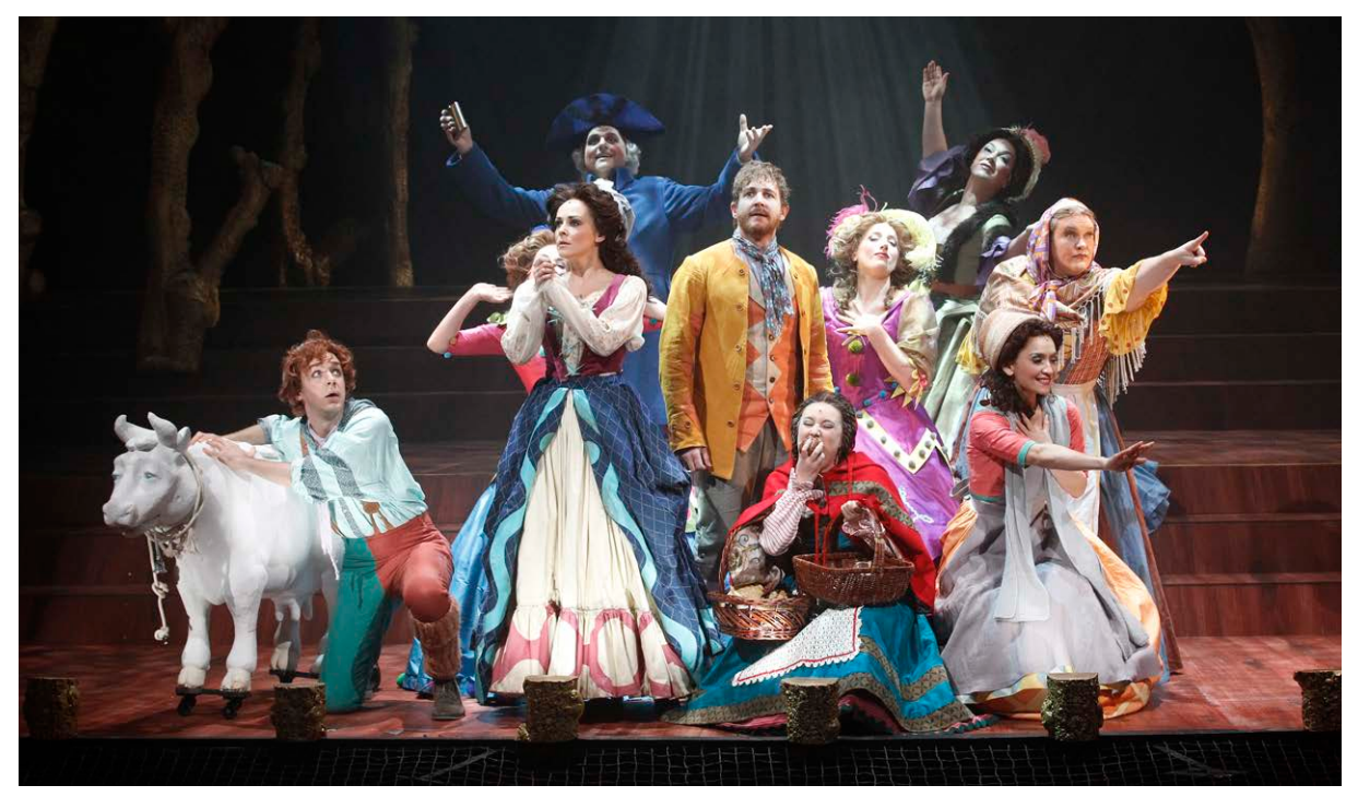
Figure 1: Victorian Opera - Into the Woods