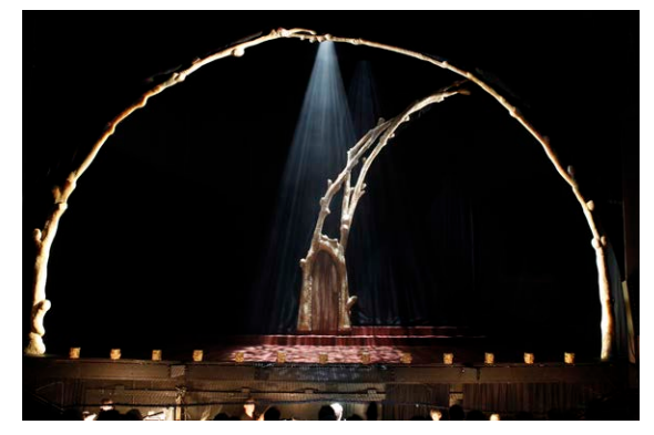
Figure 3: Victorian Opera - Into the Woods