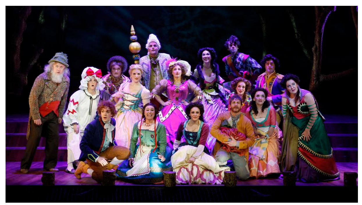
Figure 12: Victorian Opera - Into the Woods