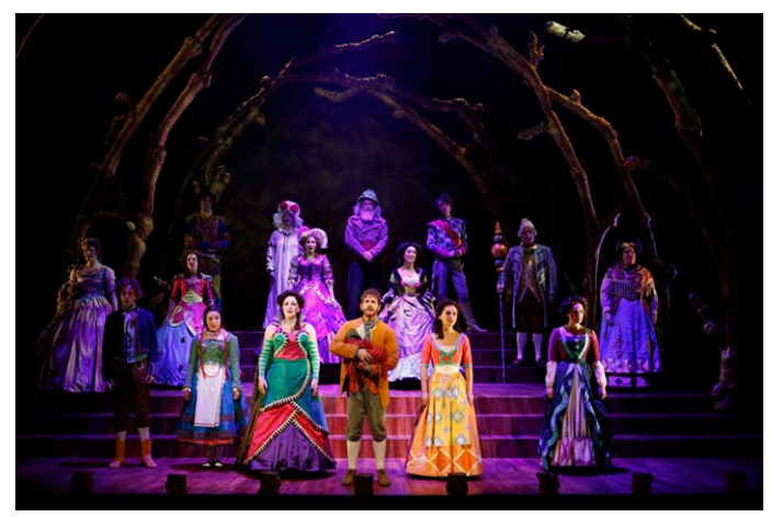
Figure 11: Victorian Opera - Into the Woods