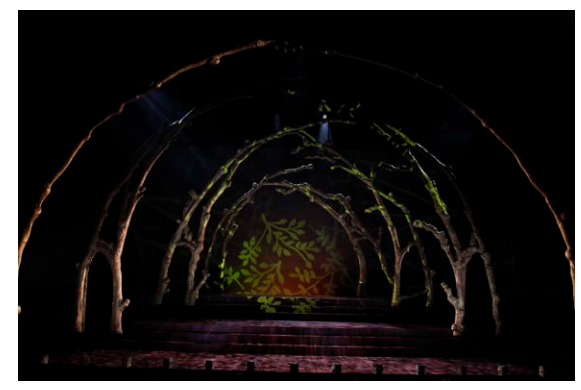
Figure 10: Victorian Opera - Into the Woods