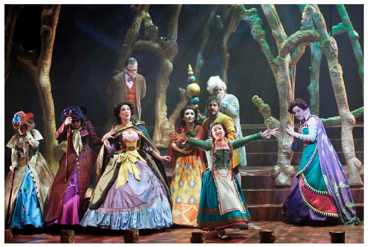
Figure 2: Victorian Opera - Into the Woods

Into the woods and down the dell, The path is straight, I know it well. Into the woods, and who can tell What's waiting on the journey?