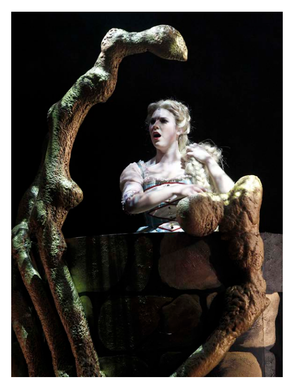
Figure 9: Victorian Opera - Into the Woods (Rapunzel)

The two acts of Into the Woods take place in several different locations such as cottages, palaces, a bakery, a tower and various exterior locations. The playing space is constructed on a number of levels. There are several different entrances and exists.