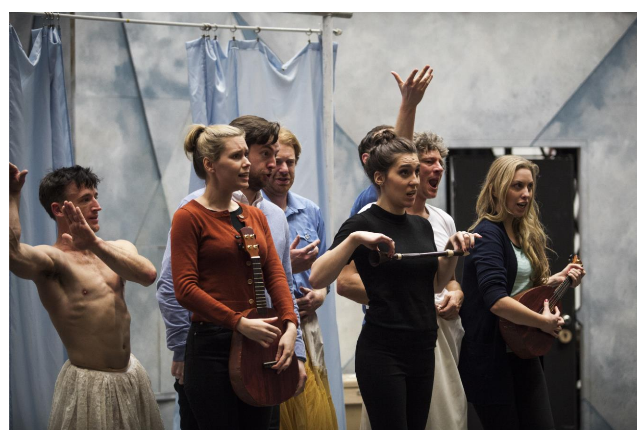
Circus Oz and Victorian Opera cast in rehearsal