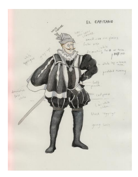
Costume designs by Harriet Oxley

The plot was always simple in Commedia. The storyline in Commedia is sometimes about death and resurrection and it is often told in a festive context. Pantalone (the main character) sometimes dies by the end of the show and the young Innamorati (young lovers) must find each other. The Innamorati do not only represent young love, but also represent regeneration. Also, Pantalone is not the only person that has to use his power. He also represents death and old age. He is the character who stands in the way of regeneration, keeping time still. Therefore Pantalone must die to make room for the Innamorati (young lovers). The characters in Commedia always talk directly to their audiences, throughout the whole play, the characters do not break contact with the audience.