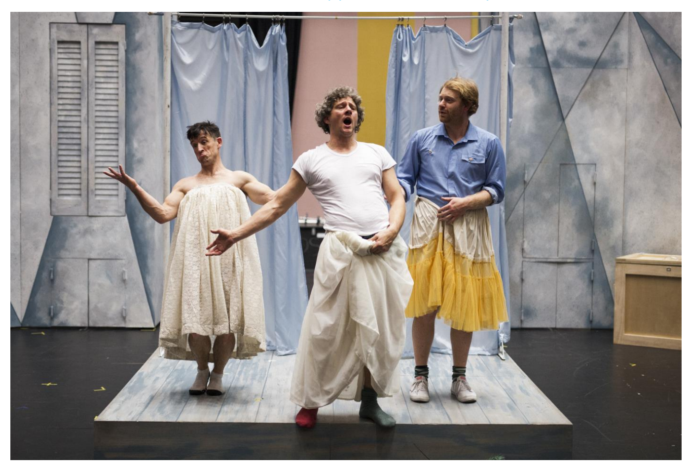
The stagehands rehearsing

A minstrel comforts Capitano who weeps for his lost love. Meanwhile Innamorata/Nedda in disguise as Colombina has joined the minstrels with Arlecchino/Beppe and both are now ready to run away. The clock strikes seven and the other minstrels remind Arlecchino and his new conquest that theatre and life are not the same thing. Just as the play is about to progress to a happy ending, the rehearsal run is interrupted by Canio, the director of the theatre with the news that World War II has been declared. All pretence of a rehearsal vanishes as the cast disperse and leave Canio and Nedda to contemplate an uncertain future, 'la commedia è finita'. Indeed art and life are not the same thing and the cruel realities of life and time have overtaken the careless joy and freedom of comedy.