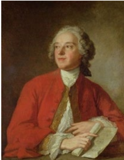
Portrait of Beaumarchais by Jean-Marc Nattier, 1755.

The original play of Il barbiere di Siviglia ( The Barber of Seville ) was written by French author Pierre-Augustin Caron de Beaumarchais (1732-1799).