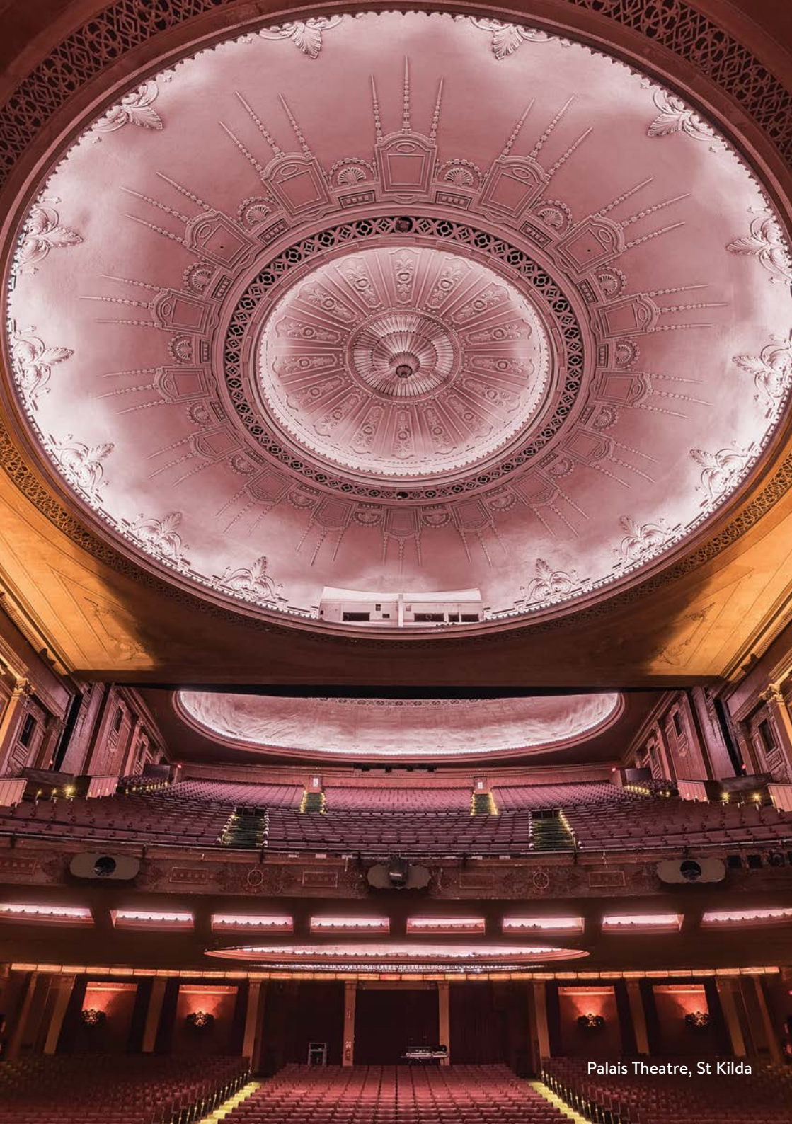
Palais Theatre, St Kilda